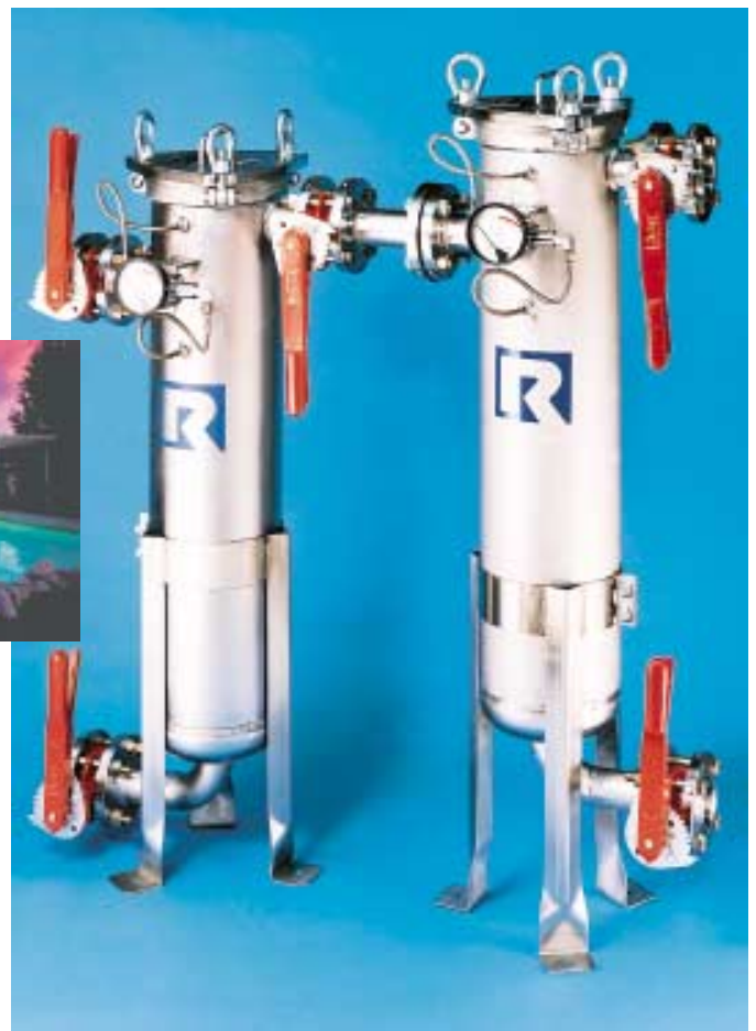
NSF-Rated Giardia Filtration System